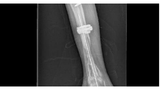
Preoperative data (lateral)