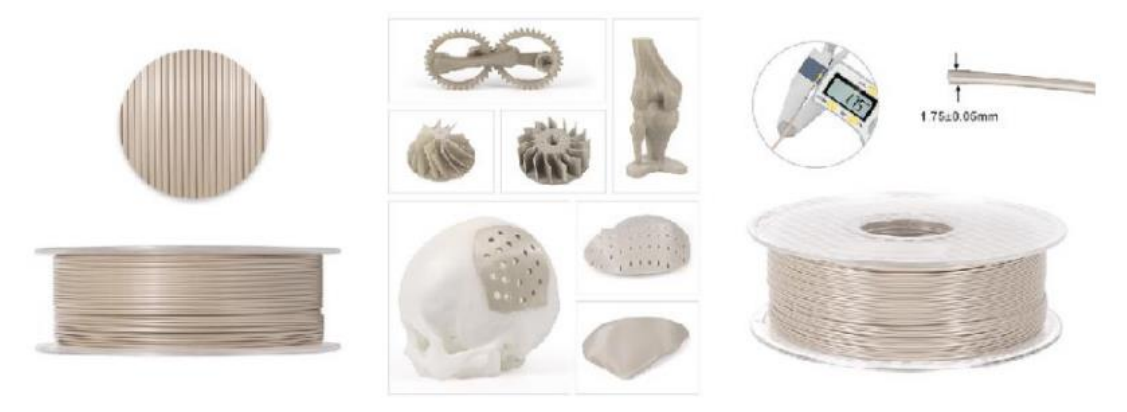
IEMAI3D PEEK Printing Filament

Compared with traditional metallic implant materials, PEEK is a semi-crystalline high molecular material with light weight and high performance. It has the advantages of light weight, elastic modulus close to that of bone, wear resistance, excellent biocompatibility, and physical stability. It is one of the ideal materials for bio prosthesis implants nowadays.