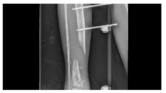
Preoperative data (orthotropic)

Male, 34 years old, needed a prosthesis to replace one of the broken tibial segments caused by an accident.